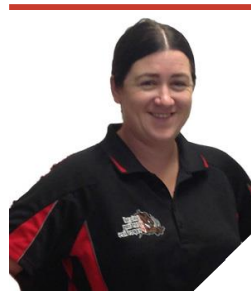
Mel Customer Service