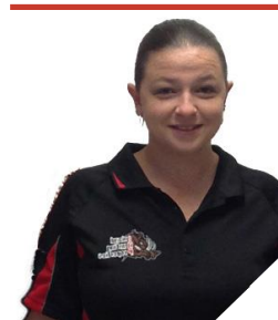
Amara Customer Service